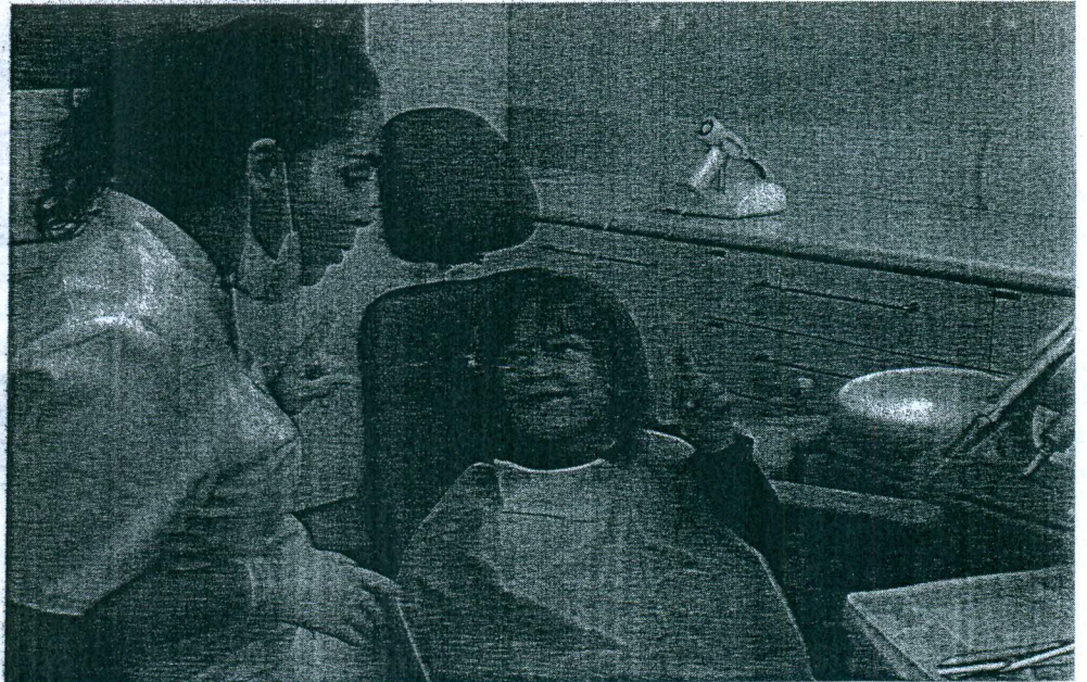
EXHIBIT 2: Service Delivery Is Enhanced through Customized Interaction with Patients Both Young and Old