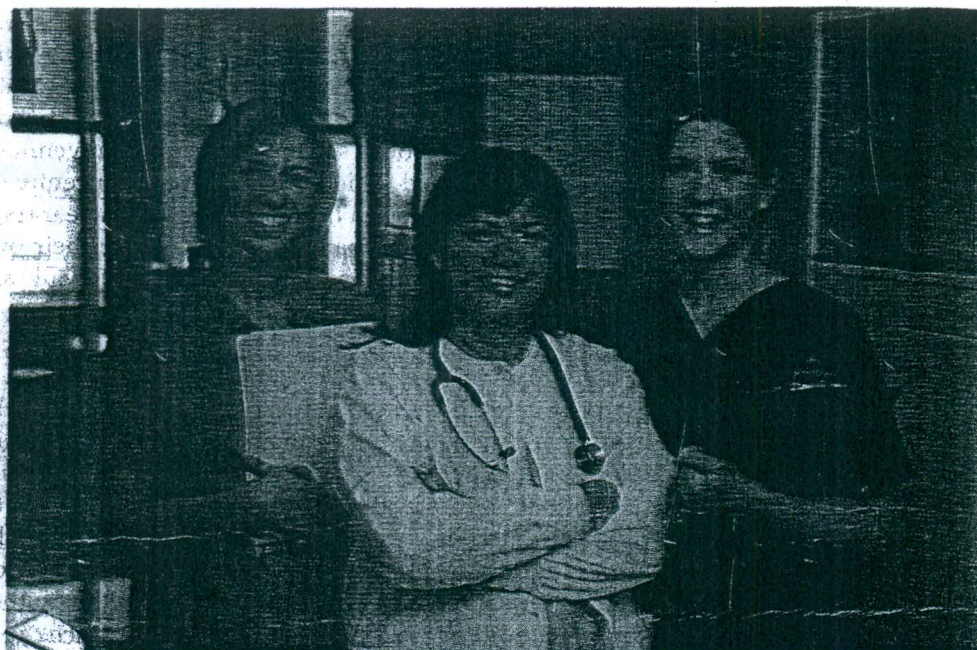
EXHIBIT 3: A Team of Closely-Knit Professionals Working Under the Guidance of a Clear, Common Mission Statement Can Help Overcome the Most Negative Preconceived Notions About Visiting the Dentist

remarked, "so I just do the best job I can and make them as comfortable as possible." Even though patients seldom expressed appreciation for her services, she hoped that she made a positive difference in their health or appearance that would benefit them in the long run.