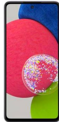
Galaxy A52s 5G review: A quintessential Samsung phone