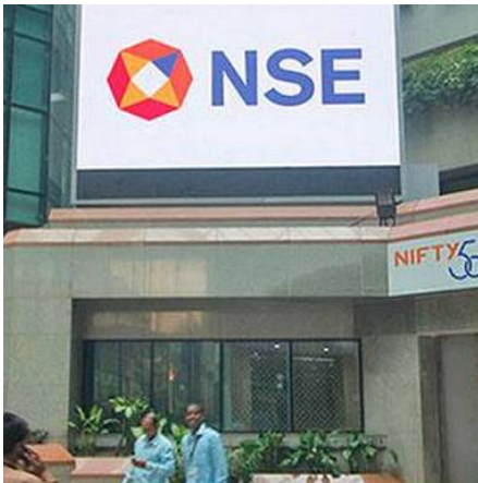
Freak trade at NSE, yet again